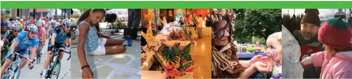
The Shorewood Criterium International Cycling Classic is a favorite summer event!