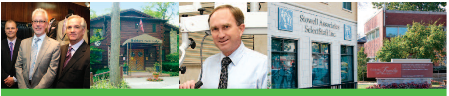
Catholic Family Life Insurance